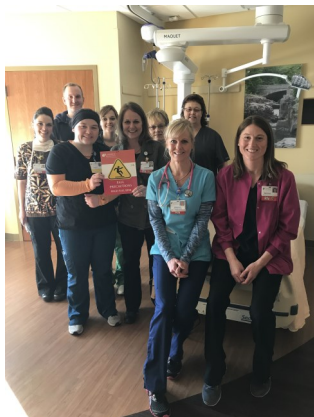
Inpatient Care Team Members